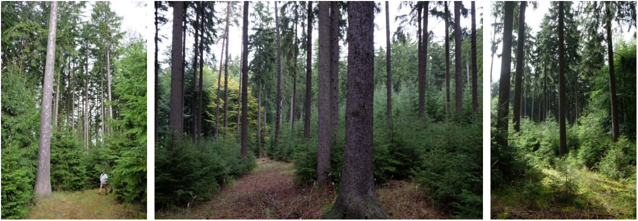
Jihlava Municipality Forest, Vilanec area

The Kinský - Žďár Forest Estate was visited in the afternoon; it is a private forest estate of 5 612 ha dominated by Norway spruce (85%) with the remainder comprising of Silver fir and European beech. The transformation of this mainly even-aged structure has been aiming at diversification of species as well as structures. In order to do so, parts of stands where the mature stand has allowed for sufficient light reaching the forest ground were under-planted with European beech and silver (both pure and/or mixed). Cutting has also focused on gap creation in order to provide opportunity for natural regeneration and support initiation of new cohorts.