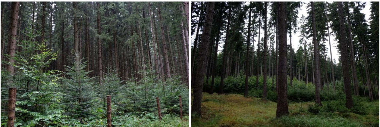
Kinský - Žďár Forest Estate

The Kinský - Žďár Forest Estate was visited in the afternoon; it is a private forest estate of 5 612 ha dominated by Norway spruce (85%) with the remainder comprising of Silver fir and European beech. The transformation of this mainly even-aged structure has been aiming at diversification of species as well as structures. In order to do so, parts of stands where the mature stand has allowed for sufficient light reaching the forest ground were under-planted with European beech and silver (both pure and/or mixed). Cutting has also focused on gap creation in order to provide opportunity for natural regeneration and support initiation of new cohorts.