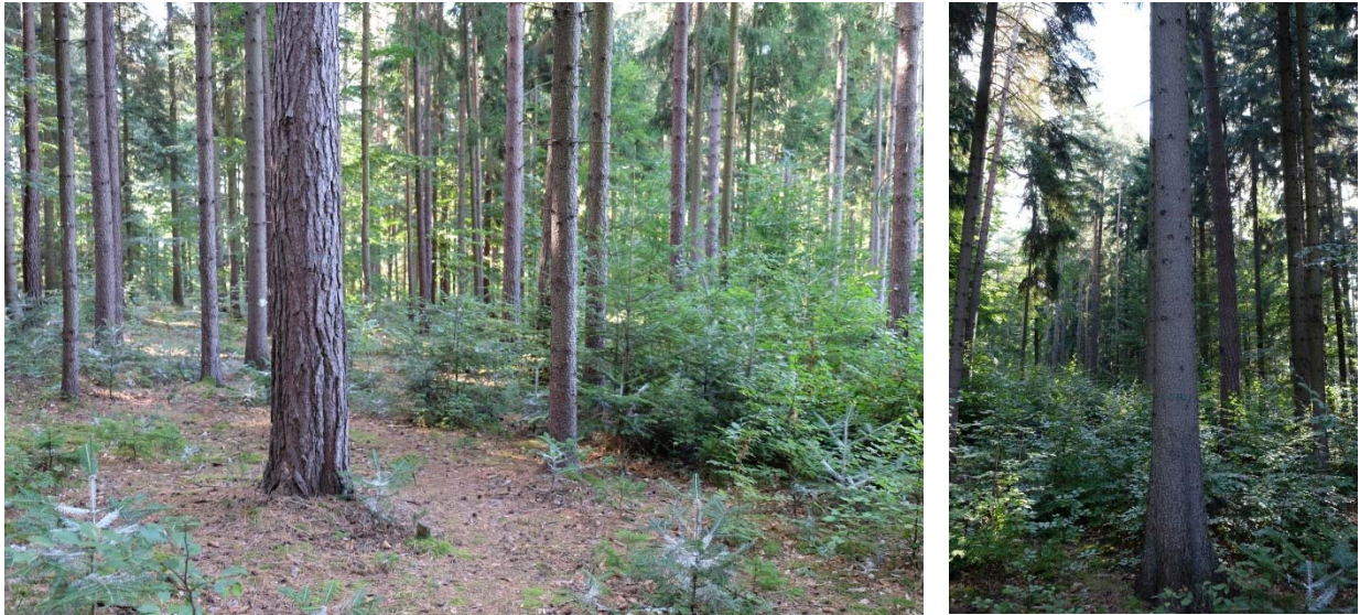
TFE (Klepačov, Pokojná Hora)

The first stop was in the forest stand at TFE (Klepačov, Pokojná Hora) that has been under transformation for past 40 years with the aim to form a multi-species and multi-age structure. Small gaps have been created by single tree cutting in order to allow for small patches of natural regeneration. Larger gaps were created in past by windblow.