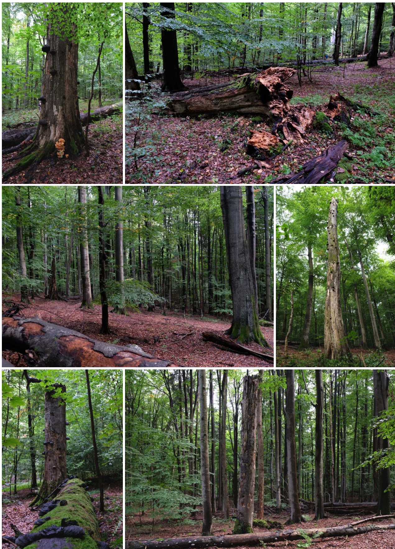
Virgin Forest at Žákova Hora